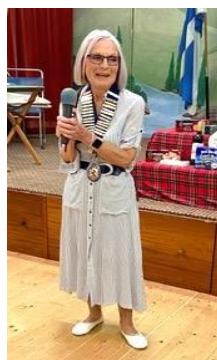
Our President ...until the end of May 2025

No news on a Care Home yet. She's going out to the garden more and she's taken to eating her meals in the dining area, which is nicer for her. She's steadily improving and there is a possibility that eventually we will get her home with a care package, whether that would be in her flat we aren't sure. Positive news anyway.