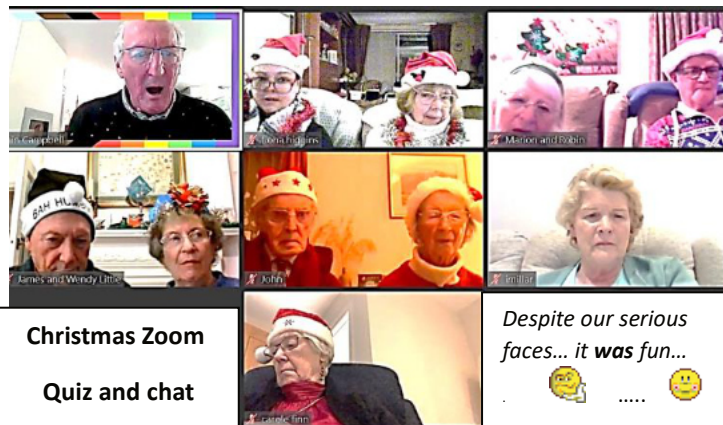
Christmas Zoom Quiz and chat