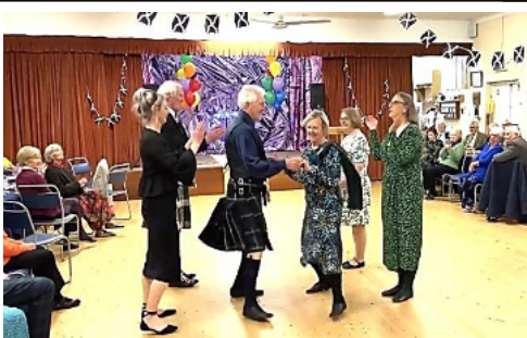
' The Flying Scotsman ' Scottish country dance performed by the Campbell family