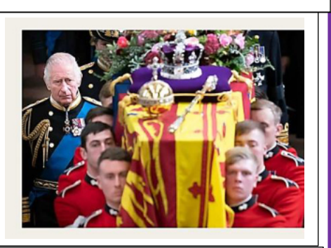
Our new King... Charles 111... follows his mother's coffin with sadness