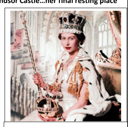
No matter which political party was in power we had one constant unbiased Head of State...our Queen. I have put a few pictures of the day below

A farewell to a Monarch who did such a good job.