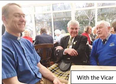
With the Vicar